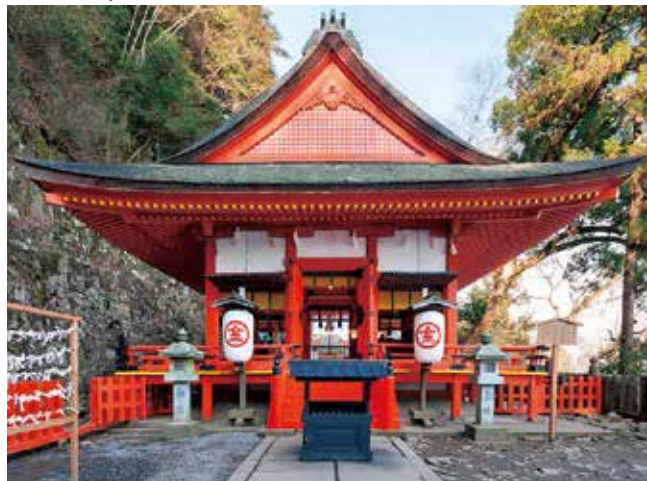
Oku-Sha (Izutama shrine)